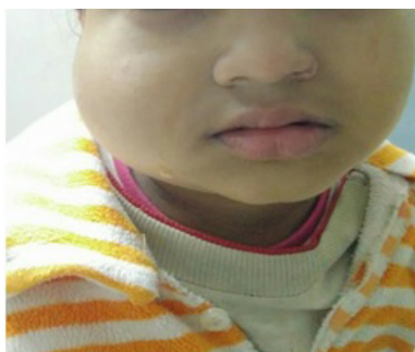
[Table/Fig-1]: Clinical picture showing right cheek swelling in a 3-year-old child.

tooth. No lymphadenopathy was found. Rest of the systemic examination was within normal limits. Thus, on the basis of history and examination, a clinical diagnosis of malignant soft tissue tumour was suspected with differentials included osteosarcoma, Ewing's sarcoma, rhabdomyosarcoma or lymphoma. Patient was sent for X-ray chest which revealed no active lesion in lungs. Routine hematological examination was then done which showed lymphocytosis and raised ESR. CT-scan of head and neck region showed a large destructive lesion involving the right side of mandible with a surrounding collection of pus/abscess formation [Table/Fig-2]. After taking proper consent from the child's father, USG guided FNA was performed from the mandibular swelling by an external approach using 22 gauge needle attached to 10 ml syringe which yielded around 12 ml of purulent material. Smears were prepared and stained with Geimsa stain which